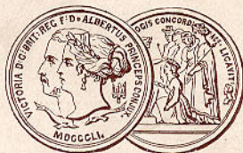
INTERNATIONAL EXHIBITION, 1872.