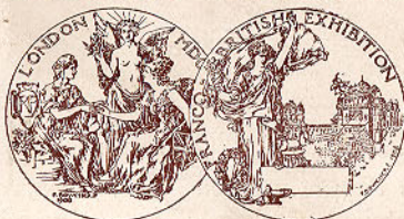
Grand Prize, 1908.