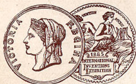
INVENTIONS EXHIBITION, 1885.